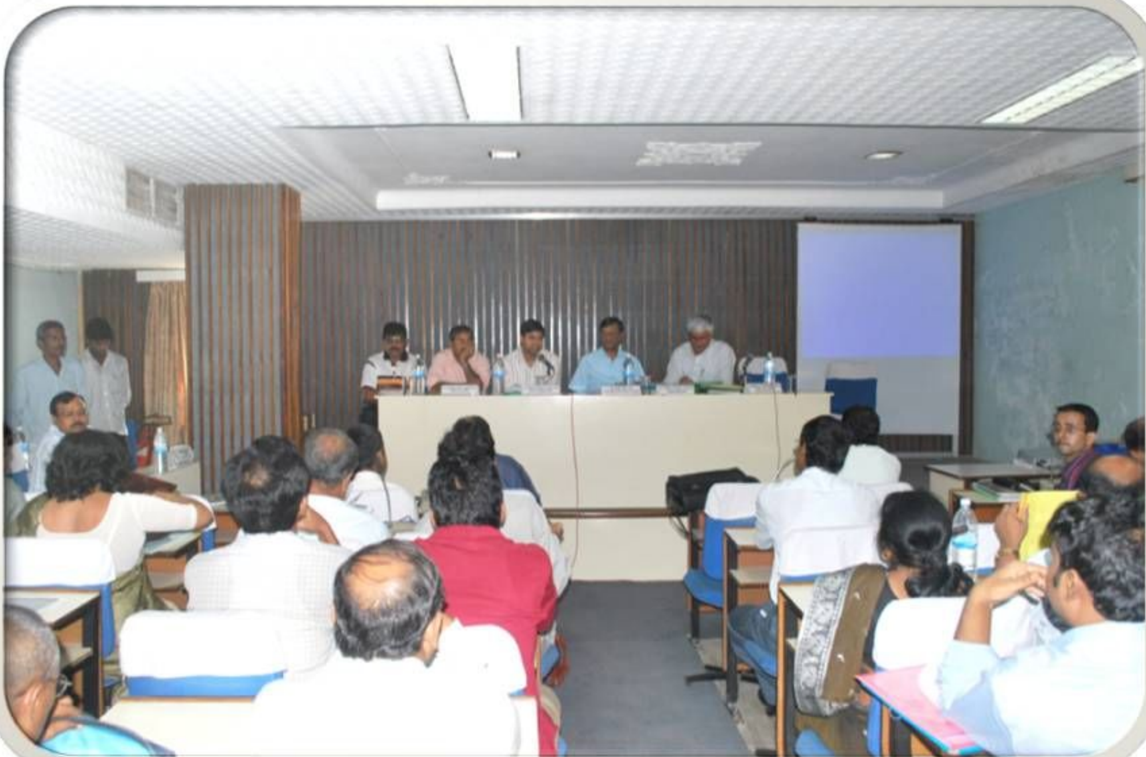
Convergence Meeting with PIA & Fisheries Deptt. At Burdwan District by Principal Secretary P.& R.D. on 10-7-09