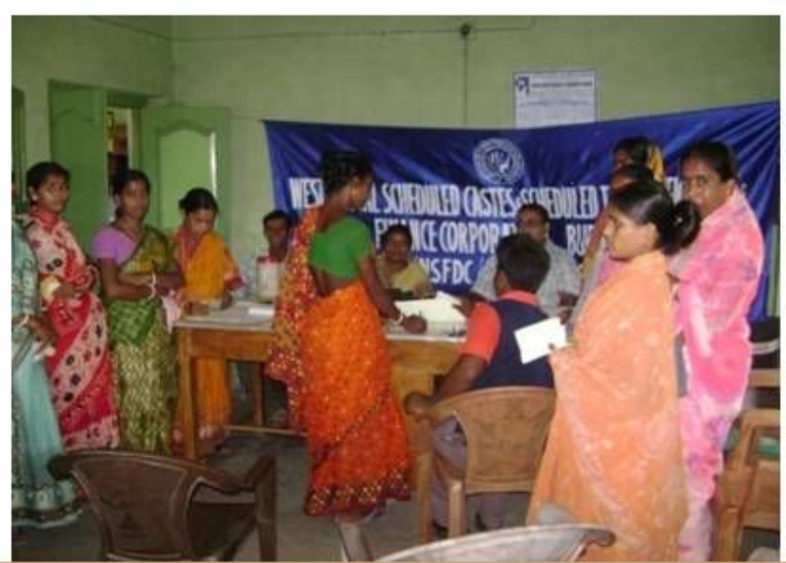
Loan Disbursement to SC Women from BCW Deptt.