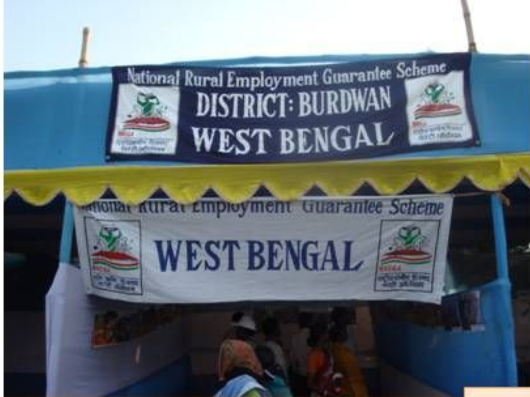
NREGS Mela—Jamalpur Block