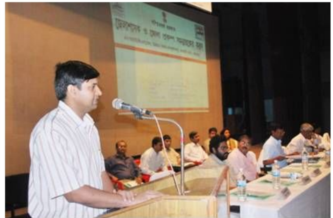
DM & DPC Burdwan in a workshop