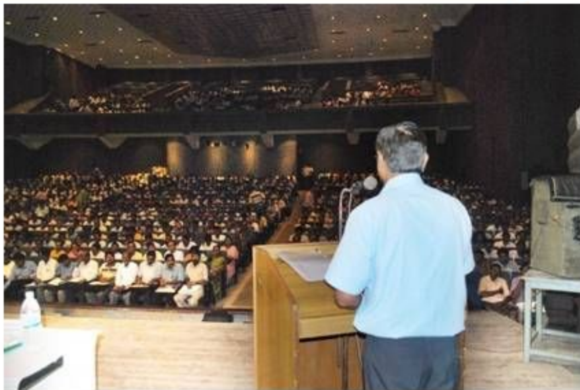
Pr. Secy at a workshop with PRI Members