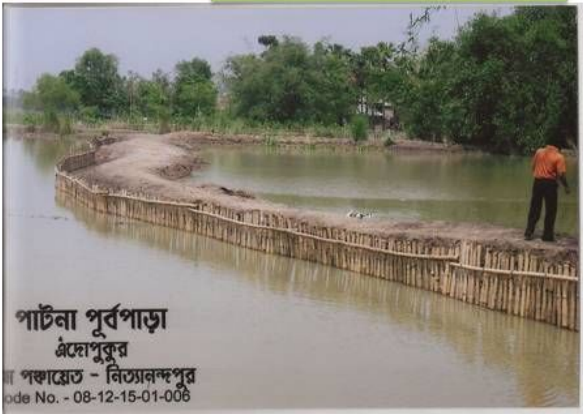
পাটনা পূর্বপাড়া এঁদোপুকুর গ্রাম পঞ্চায়েত - নিত্যানন্দপুর Code No. - 08-12-15-01-006